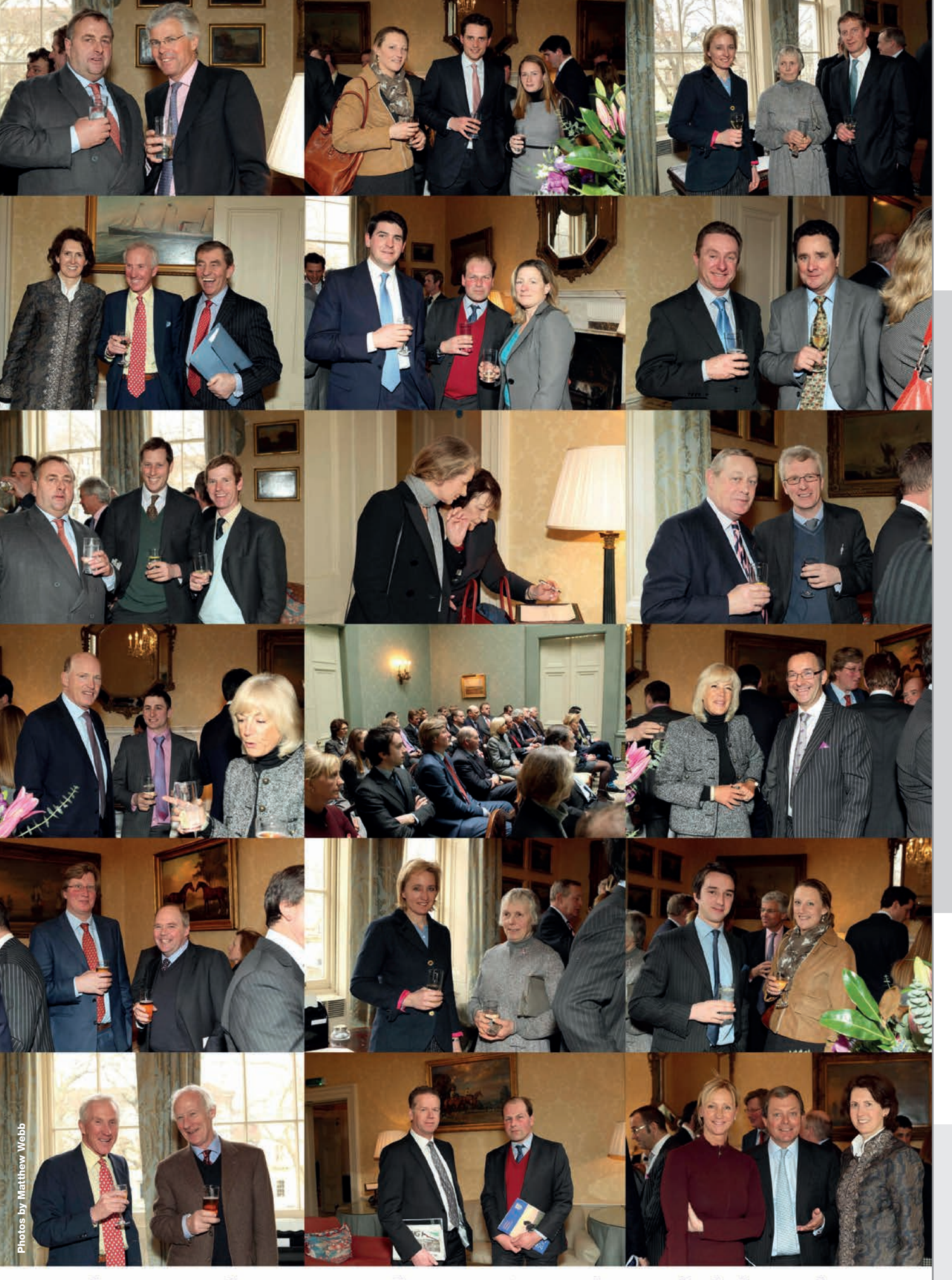
The National Trainers Federation AGM The Turf Club London 28th February 2013