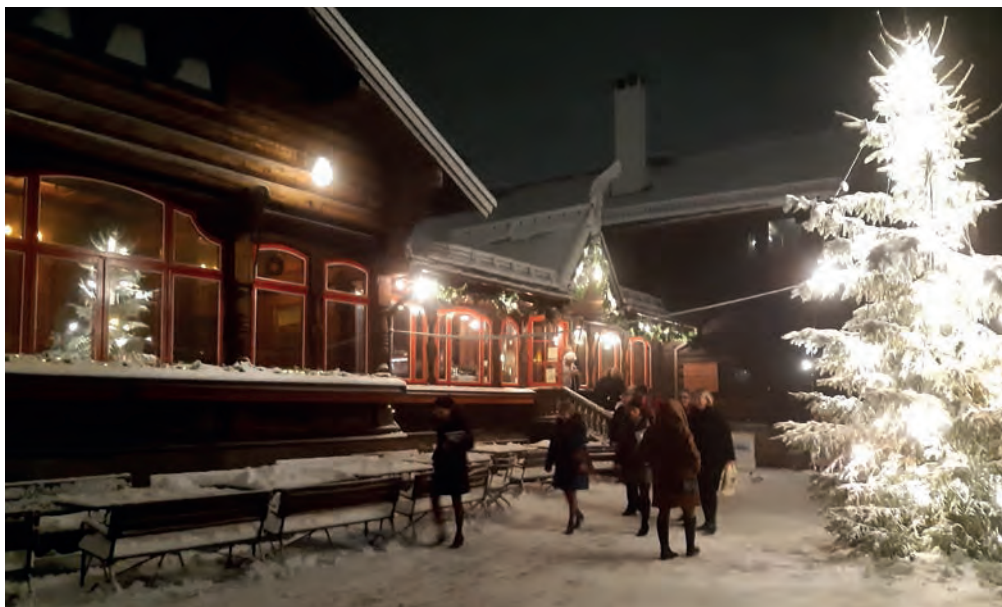
ETF AGM 2019 – Oslo

A benefit of our membership is that all NTF members receive a free subscription to European Trainer Magazine.