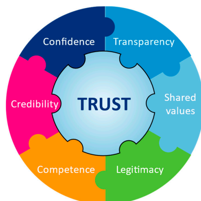
Figure 2. Parameters that underpin trust. Society's trust in an industry or activity is underpinned by a range of factors, including confidence in the transparency of the industry's operations, the credibility, legitimacy, and competence of its leaders and practitioners, and the relevance to society of the values that it espouses.

In terms of priorities, establishing public trust is key to improving the status of an industry's SLO [2,4,14,48,103] (Figure 2). In this context, trust implies confidence that the industry will act with integrity and 'do what's right' [103,104]. When faced with a negative slide in their social licence, some industries assume that they have an image problem when in fact, their problem is lack of public trust [9]. This is an important distinction because, although image and trust are related, a problem with each of these concepts requires a different response [9]. Stakeholder research can be extremely informative in this regard and can guide an industry towards beneficial change [9].